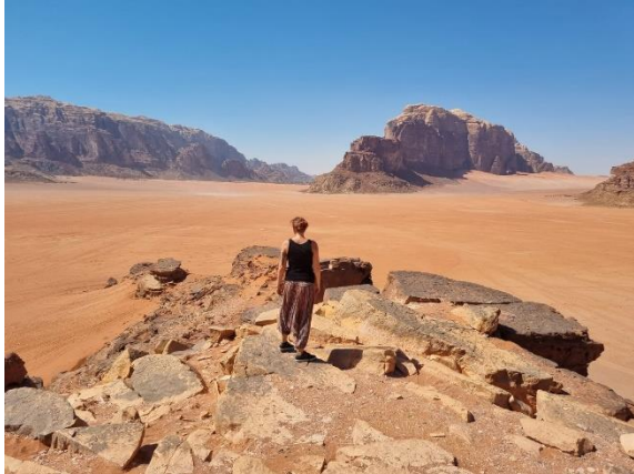
Wadi Rum Desert

Sinai: Living in Israel gives you the chance to visit beautiful Sinai and go snorkeling or to get the diving license. I absolutely loved it, it was my first time swimming with turtles and the living expenses are quite cheap. I can recommend Dahab and the blue hole for snorkeling or diving.