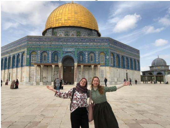
Temple Mount - Jerusalem