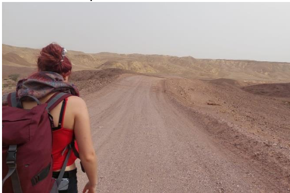
Hike in the Negev