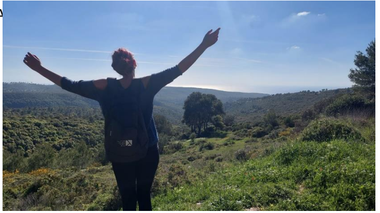
National Park Mount Carmel