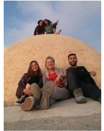
Hike in Nablus with our couchsurfer

I travelled a lot in Israel, sometimes with a touristic focus and on other occasions with a political focus. For political tours speaking about the occupation in the West Bank I would highly recommend “breaking the silence” which is a tour organized by ex-soldiers of the Israeli Defense Forces. All over Israel you can find the “Abraham Hostel” and they offer an interesting tour called “Dual Narratives” in Jerusalem. It is guided by a Palestinian and an Israeli tour guide who talk about their perspective on the holy city. To see both sides of the conflict, I went to the West Bank and did lot of couchsurfing. Locals showed me around the cities of Hebron, Jericho, Ramallah, Bethlehem, Nablus. Don’t be afraid to go there, the people were so kind, hospitable and interested in showing us their lives.