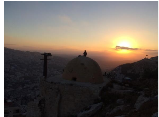
Holy Islamic Shrine in Nablus

One of my favorite things to do was salsa night in Haifa. The restaurant/bar “Menches” is located in the German colony and offers a free salsa course every Tuesday at 8:30, which consists of four different levels. Every Friday there is a party close to the Talpiot market as well. The GAG21 is a rooftop party from midday until noon where you enjoy the view on the sea and harbor.