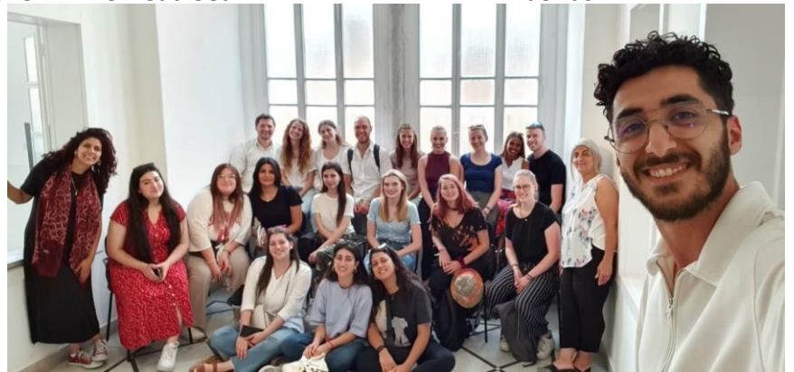
Erasmusstudents and Buddies