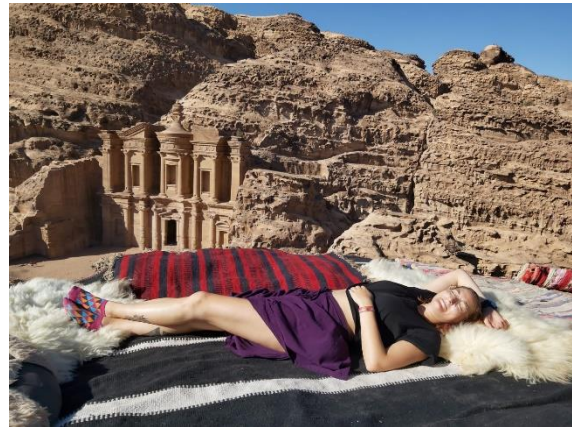
Petra - Wadi Musa