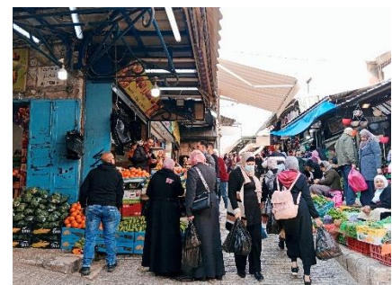
Market in Jerusalem