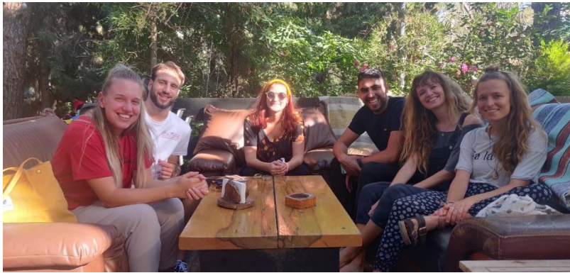
Couchsurfer showing us Ramallah