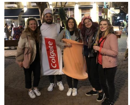
Purim in Tel Aviv

The Israelis like to celebrate, be sure to spend time in Tel Aviv during “Purim”, which is kind of like a carnival. Also go to Tel Aviv to experience the diversity during the Pride Parade.