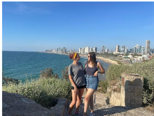
Tel Aviv – Jaffa