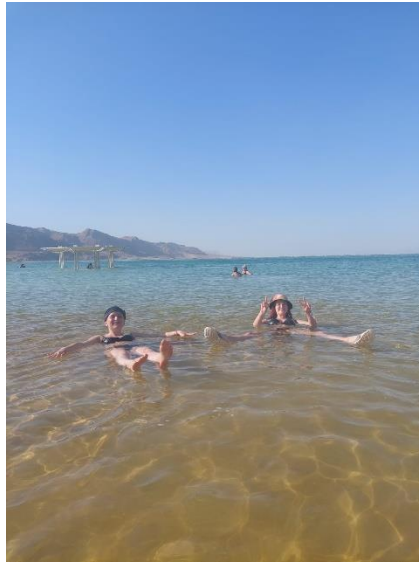
En Bokek – The Dead Sea