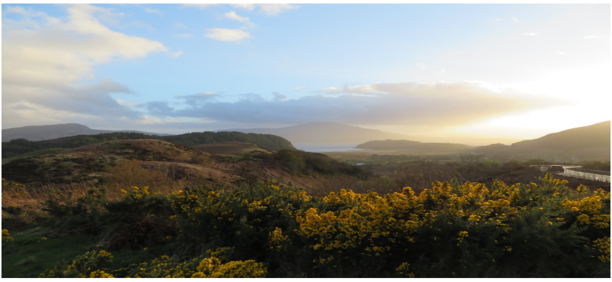
Isle of Skye

Since Aberdeen is not far away from Cairngorms National Park, we rented a car several times and went hiking and horseback riding. The national park is huge, the nature there is beautiful and you find some nice distilleries on the way. Make sure that you don't miss the highland games, it was a great experience to see true Scottish culture!